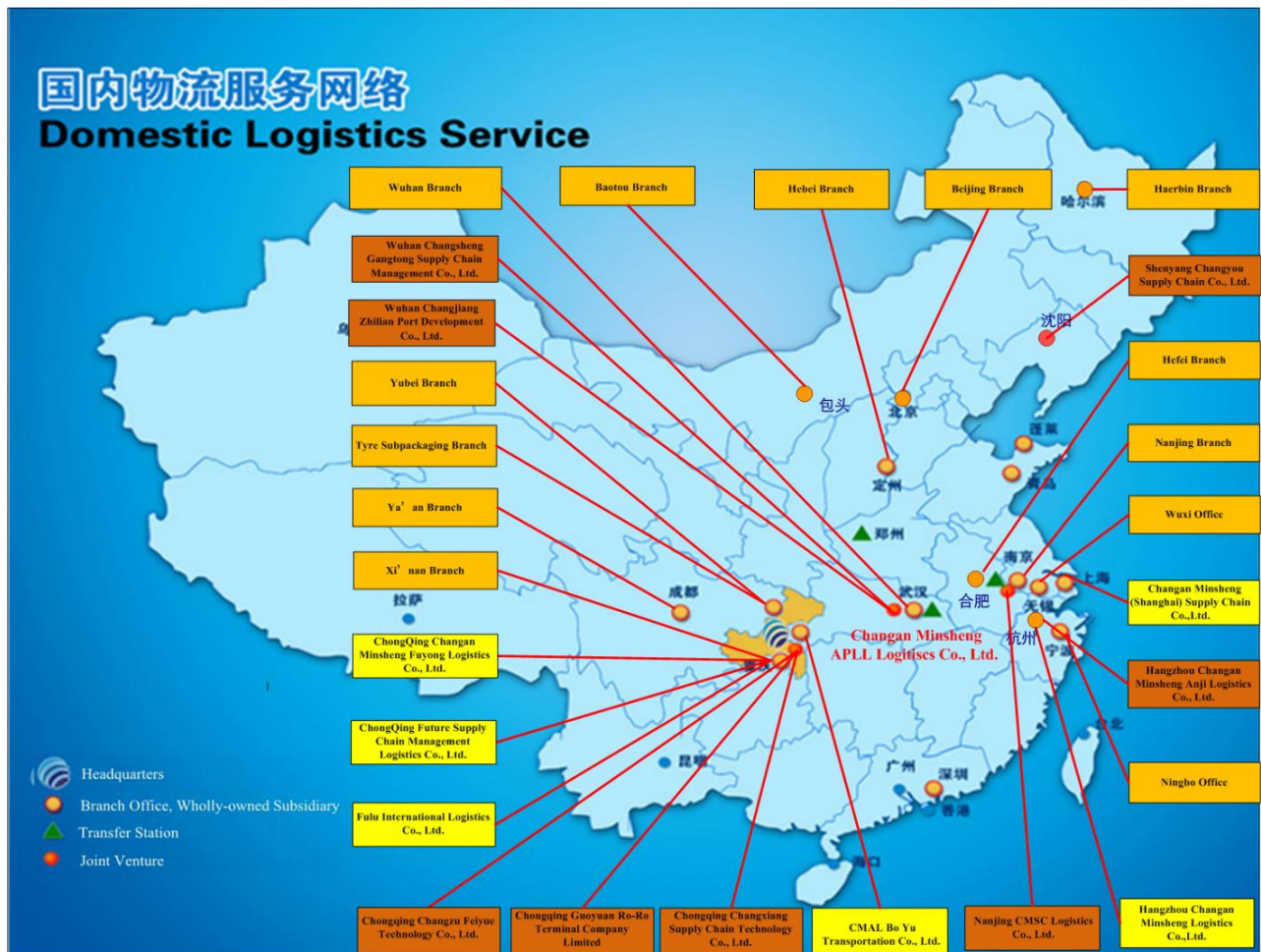
Picture 2: Location of the Company's existing branches, subsidiaries, associated compaies and representative offices

As at 31 December 2021, the Company had a total of 27 branches, subsidiaries, associated companies and representative offices, which are mainly located in East China, Central China, North China, South China and Southwest China (Picture 2). The continuous enhancement of service network enables the Group to provide logistics services to different parts of the country.